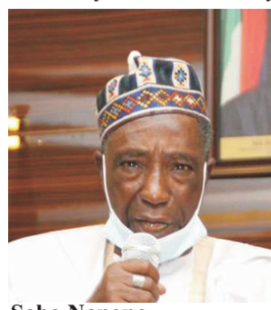
Sabo Nanono Min. of Agric. & Rural Dev.

He lamented rising insecurity in the country,